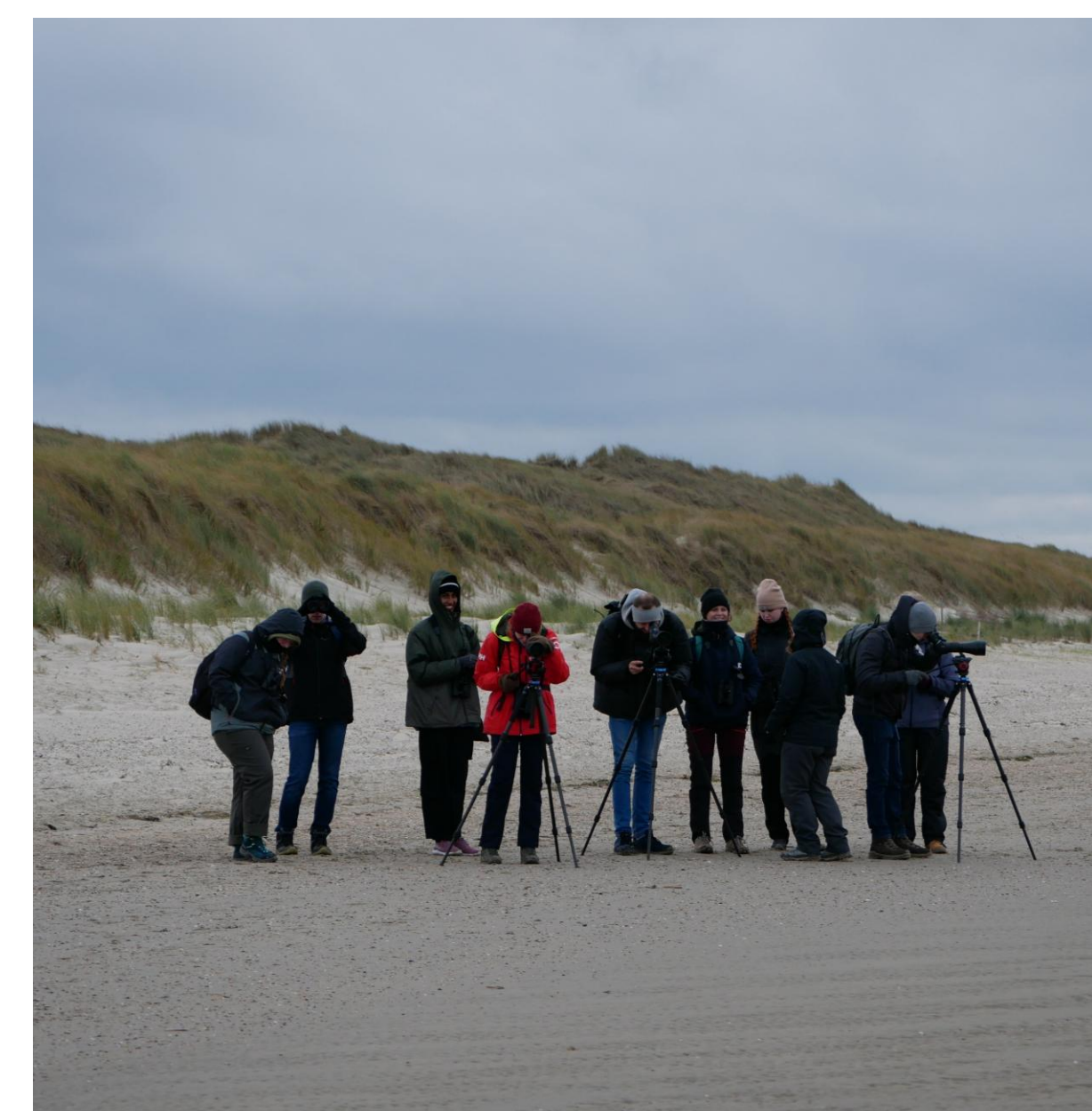
...and in the field.