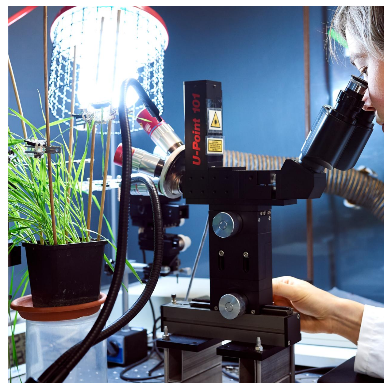
Learn and work in the lab...