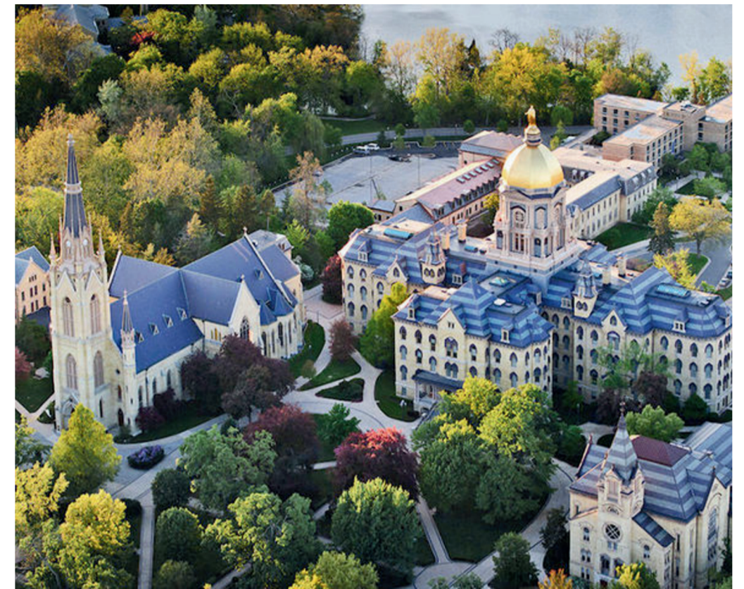
University of Notre Dame (USA)