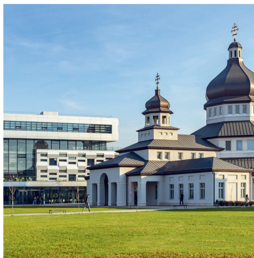
Ukrainian Catholic University, Lviv (Ukraine)