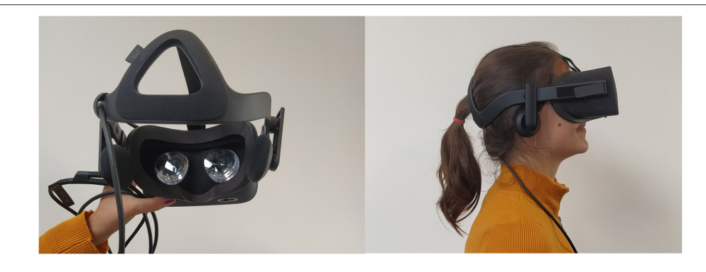
FIGURE 1 | Representation of a head-mounted display (HMD, HTC Vive, New Taipei City, Taiwan) with an integrated binocular eye tracker measuring at 250 Hz (SensoMotoric Instruments). The picture shows a staff member of the working group and thus not a study subject.

of the screen. The fixation cross turned red as soon as the gaze fall within a rectangular area of 2.2^{\circ} by 2.2^{\circ} centered on the fixation cross. After a variable fixation period of 500-1,000 ms, the fixation cross disappeared and a small black open circle (0.5^{\circ}) appeared as target stimulus at one out of 8 possible locations (left, right, up, or down at 5^{\circ} or 10^{\circ} ) for 1,000 ms. Trials were separated by an intertrial interval of 1,000 ms. Each of the eight target locations was presented 24 times in a random order and all stimuli were presented against a square white background panel of 50^{\circ} by 50^{\circ} presented at a virtual distance of 150 cm. The panel was always shown in front of the participant unaffected by head movements.