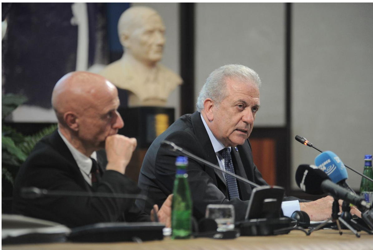
From left to right, Marco Minniti, Italian Minister of the Interior, and Dimitris Avramopoulos, European Commissioner for Migration.

One may suppose that, however unintentionally, remote control contributes to the securitization of migration control (that is, the perception that migrants are a security threat, physically and to the welfare state), and – very important – does not necessarily assuage the feelings of threat exploited so skillfully by various political parties and movements across Europe and North America. Moreover, as events in recent years seem to suggest, in extending control afar and thus minimizing the number of migrants arriving, the externalization strategy has not helped to convince EU member states to cooperate in the distribution of the initial costs of protecting refugees