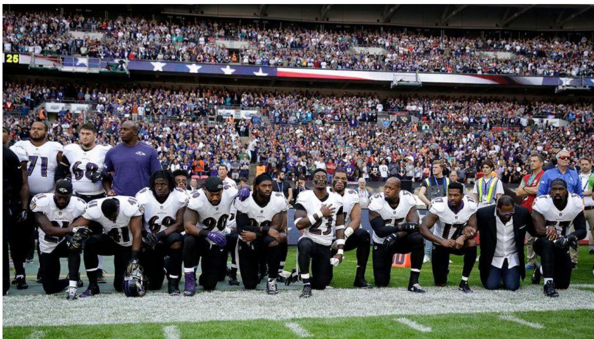
Black NFL players who have been protesting racism and police violence by kneeling in the United States.

GB: Finally, in the last years, we have been experiencing a strong form of distrust and backlash against globalization, the political and economic elites, the EU, and we have seen the rise of populism in Europe. Do you think these phenomena constitute only a threat to the stability and future of the EU or also an opportunity to reform the Eurozone and the European Union?