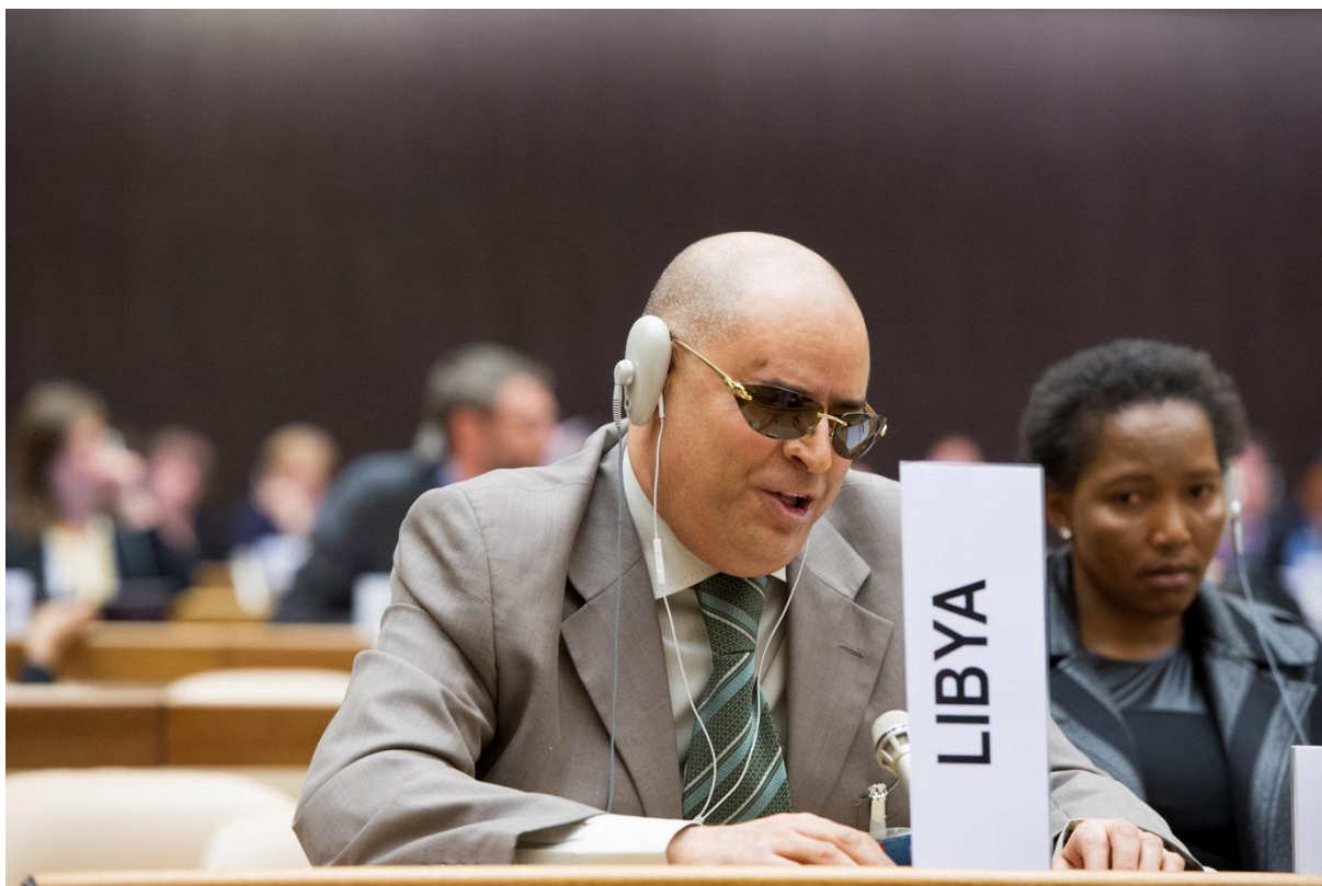
The Representative of Libya addresses during the Panel discussion on the Role of local authorities in promoting inclusion of refugees and migrants, Palais des Nations. 8 May 2017.

Restrictive policies in themselves, such as trying to keep migrants from reaching the shores of Europe, harden the image of migrants as potential economic competitors. Most of the opposition to asylum-seekers in Europe nowadays comes from those authoritarian political forces who openly advocate the exclusion of “others”, for example, right-wing populist parties.