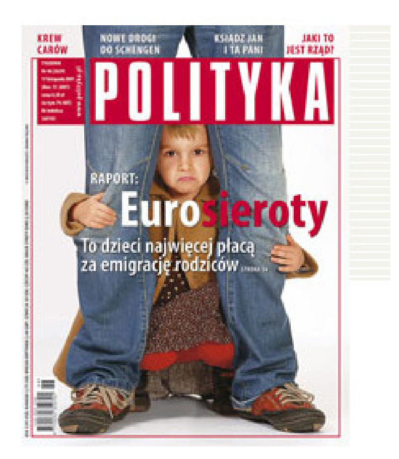
Figure 3 "Euro-orphans" <sup>15</sup>