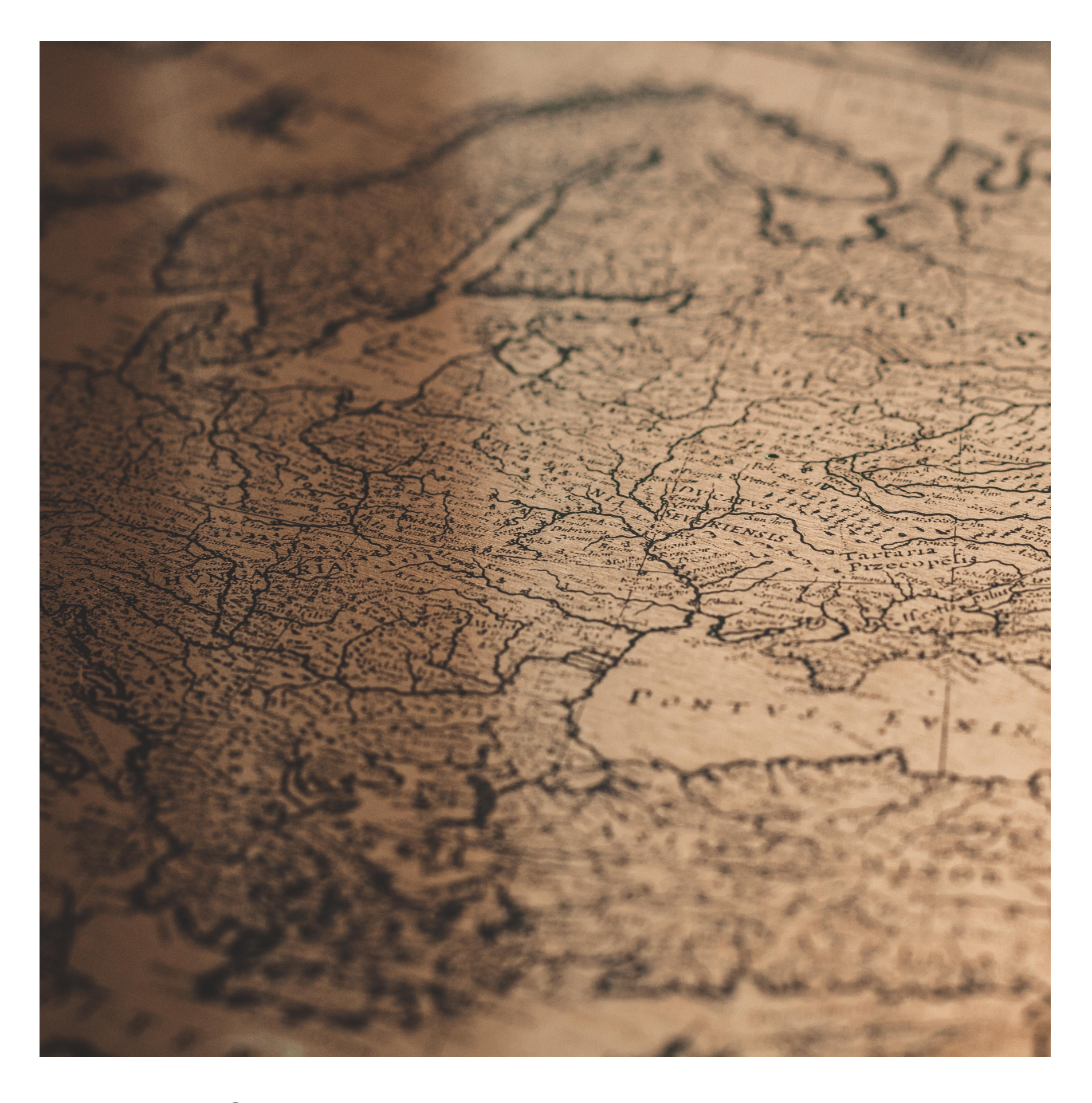
Research Training Group 2225

"World politics: The emergence of political arenas and modes of observation in world society"