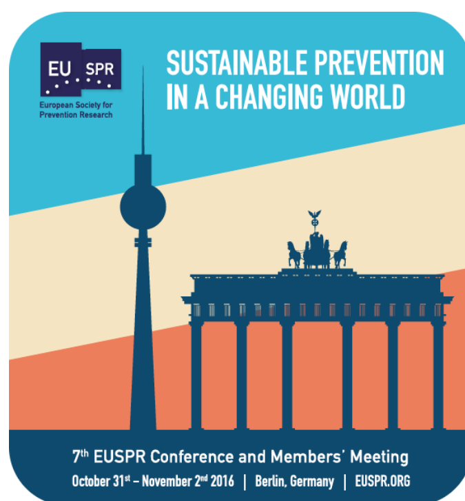
Our Seventh Conference - Berlin 2016