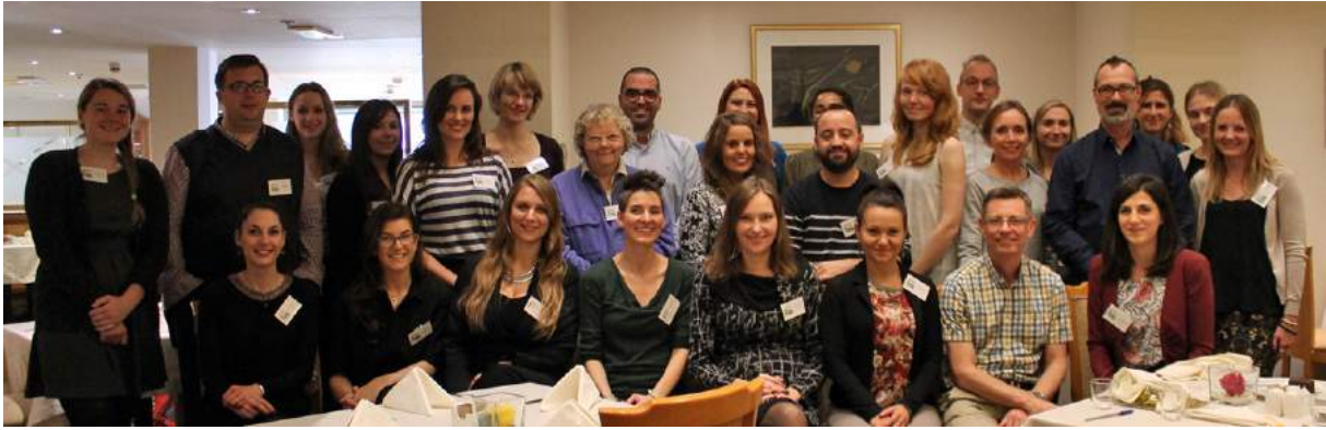
'Attendees at the 2015 early career networking lunch'